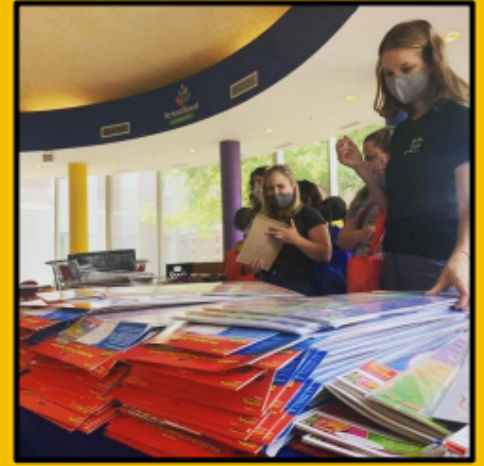
Teacher Toolbox Classroom Materials Supply Distribution during New Teacher Orientation