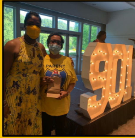
109 Parent Ambassadors from 73 Schools in Attendance at the Parent Ambassador Orientation