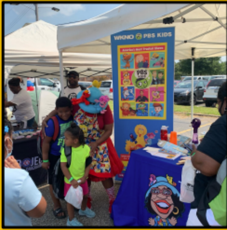
23 Partners and 2,000 Backpacks with Supplies at the Return Stronger Family Festival/Block Party